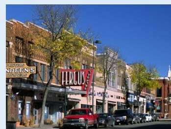
Fergus Falls: Page 5