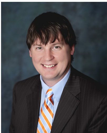
From the President

Just a few months into 2018, APA Minnesota has much to celebrate.